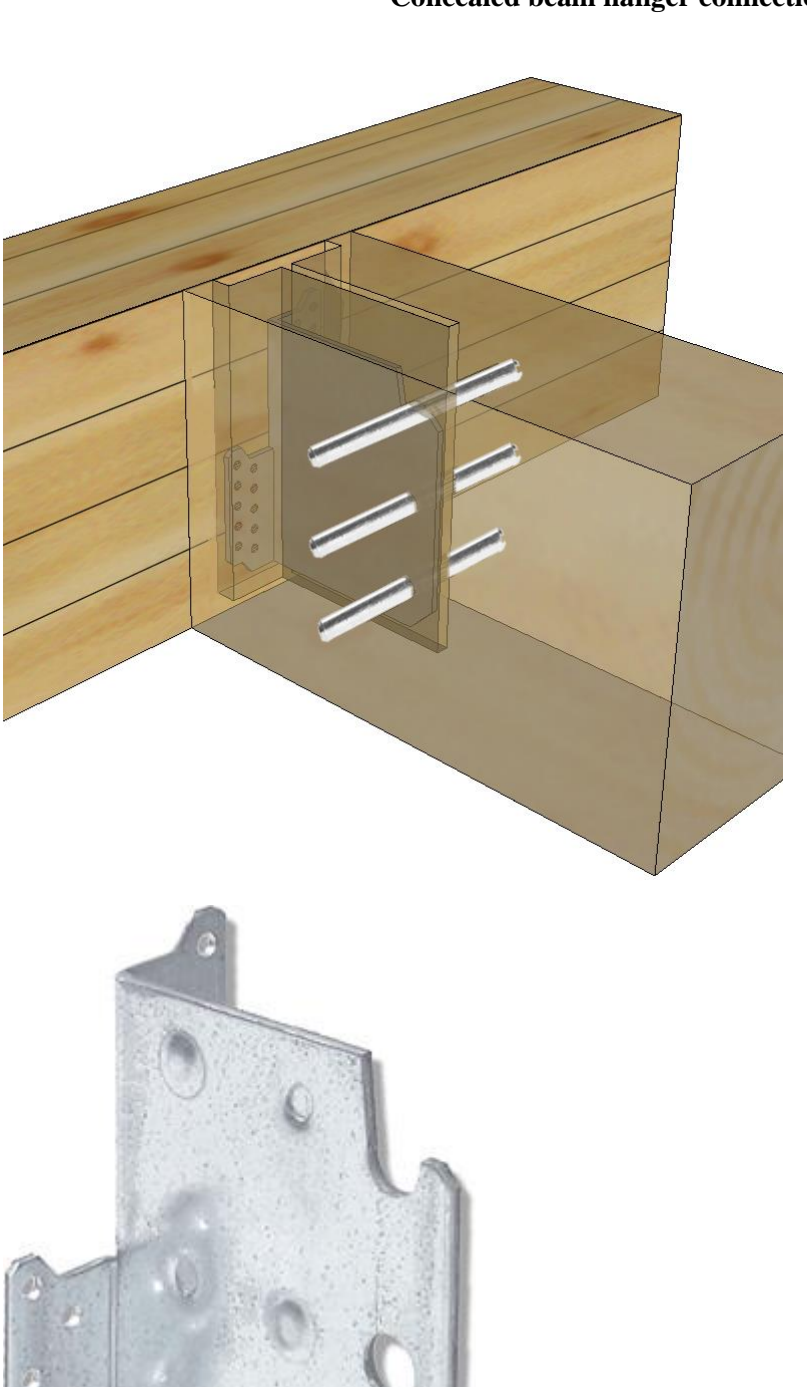
Annex C Concealed beam hanger connection