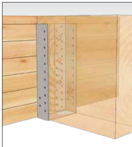
Type I 05 / 2.5

● Standard sizes | nH 1 = number of holes in the flanges facing the main member nN 2 = number of holes in the flanges facing the secondary member Further dimensions on request.